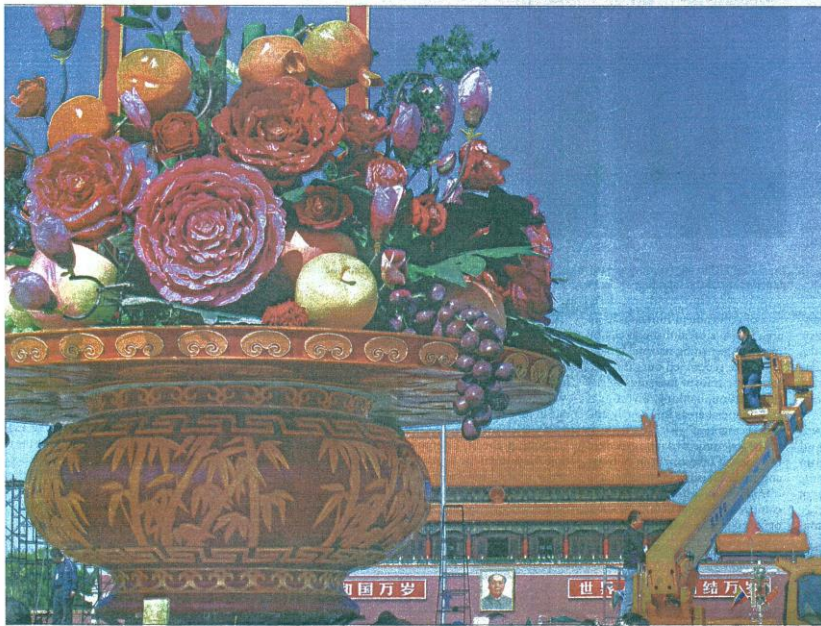
mines a giant basket of artificial flowers and fruits in the center of Tian'anmen Square. The display was built to send "blessings to the motherland".